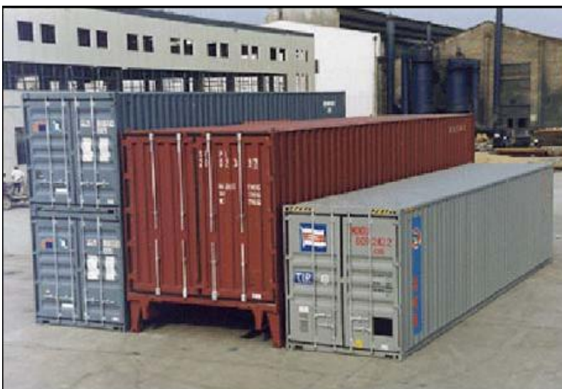
Figure 2. SECU box with standard containers.